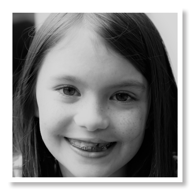
Building Hope and Smiles